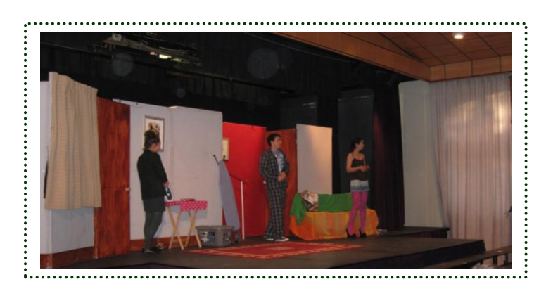
A scene from "Les Filles", performed by the Onatti Theatre Company.